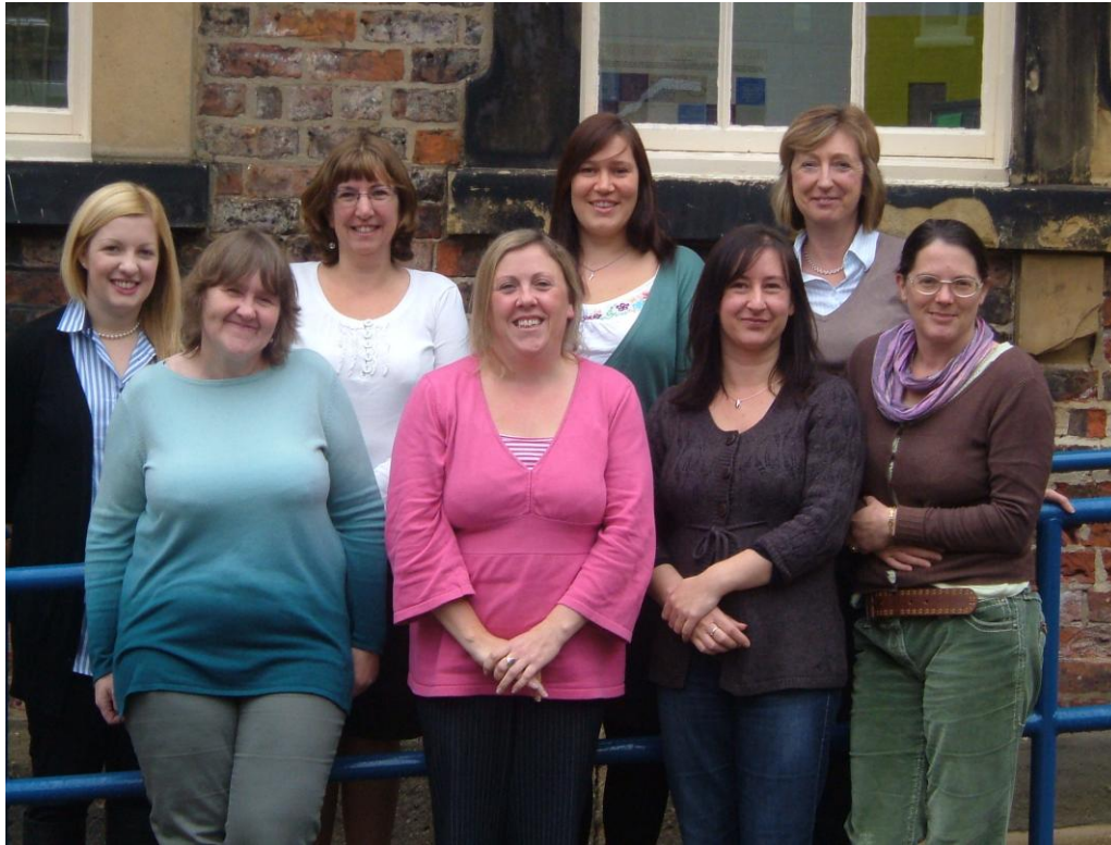
York Carers Centre Staff

Please visit our new website www.yorkcarerscentre.co.uk