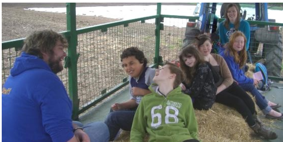
The younger group having fun on a tractor ride at The Farmers Cart!